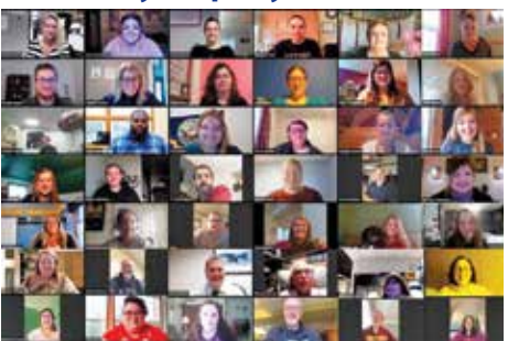
Thanks to a $30,000 capacity building grant from the Capital Region Community Foundation , Highfields will carry out an agency-wide Diversity, Equity and Inclusion initiative to enhance the organization's culture and work with families in the community.