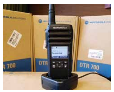
Thanks to the Joe D. Pentecost Foundation , Highfields' staff is equipped with new radios to ensure the safety of students and improve communication on campus.