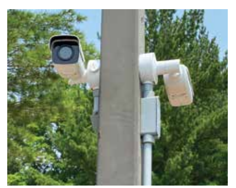
The R.E. Olds Foundation granted funds to upgrade the cameras and security system on Highfields' campus.